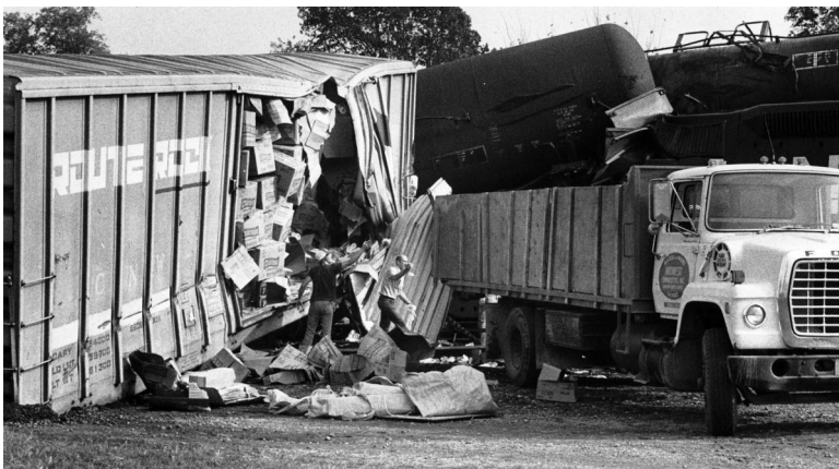
Sample photos from the website.